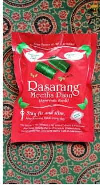
Rasarang Meetha Paan

Have you ever wondered of a paan that claim to be supporting the Swachh Bharat Mission? Sounds crazy, right ?